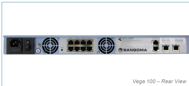
Vega 100 – Rear View